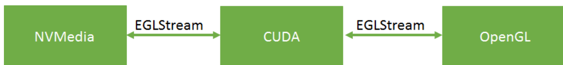
Figure 3 EGLStream Pipeline

NvMedia and CUDA connect as producer and consumer respectively to one EGLStream. CUDA and OpenGL connect as producer and consumer respectively to another EGLStream.