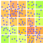
free energy assigned by WHAM