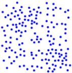
CV-space explored by bias-exchange